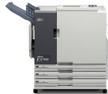
Full Color Inkjet Printer ORPHIS