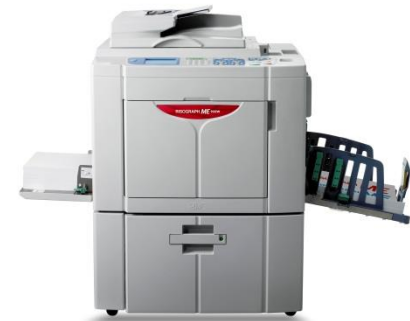
High speed digital duplicator RISOGRAPH