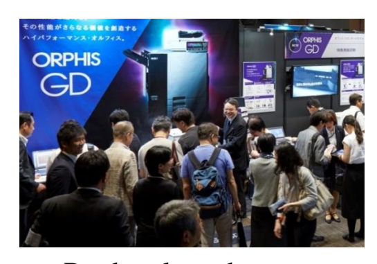
Product launch event

Japan: September 2016 Overseas: January 2017